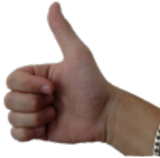
END THE DIVE