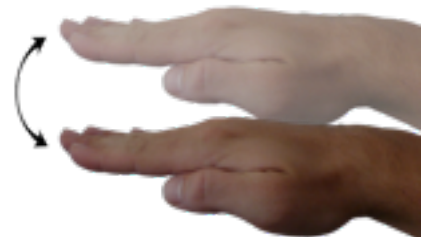
ASCEND TO NEXT LEVEL